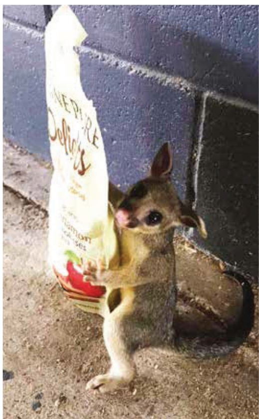
It's not just ponies who love the Equine Pure Delights!!!

Pony Club NSW rider of the month January 2019 loving her GiddyUp